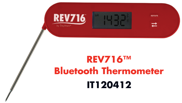
REV716™ Bluetooth Thermometer IT120412